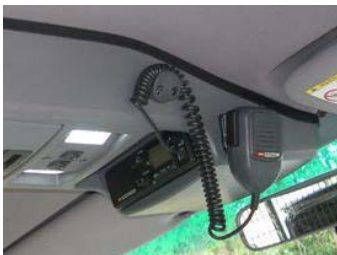
Install microphone clip on slight angle (same as console)

Install in a position that suits best, depending on vehicle. Ensure microphone or microphone cable holder does not foul on sun visor when pulled down.