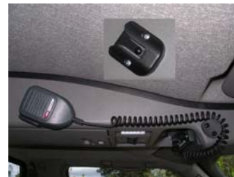
Install microphone clip on acute angle